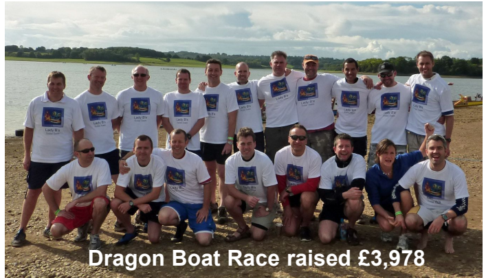
Dragon Boat Race raised £3,978

There were many fundraising events during the year including the ever popular and always successful Christmas Bazaar £3,300, Summer Fair £2,588, Fireworks £1,373, Pamper Evening £735 and playground cake sales £668. The Quiz Night, Children's Discos, Mother's Day and Father's Day Shops, sales of DVDs of school performances, second hand uniform sales and www.easyfundraising.org.uk raised further funds. This year we introduced some big new events: the Dragon Boat Race £3,978, a PTA Runners sponsored run £1,906 and a Summer Ball £3,047 all of which were most enjoyable and raised significant sums. Your PTA works very hard at organising these events and is pleased that