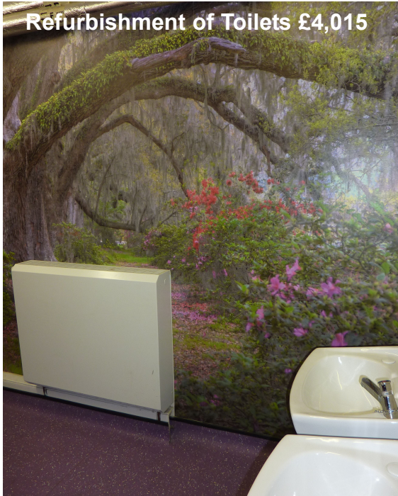
Refurbishment of Toilets £4,015

Your PTA raised a record total of £19,650 in the 2011-12 academic year and we donated items totalling £13,320 to school. Thank you for supporting our fundraising events - here's what we bought!