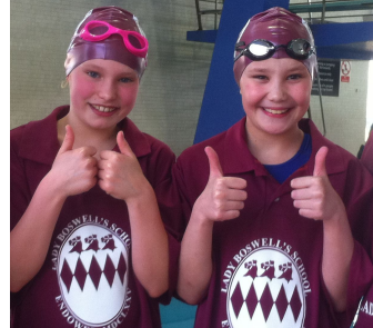
Swim team kit £264