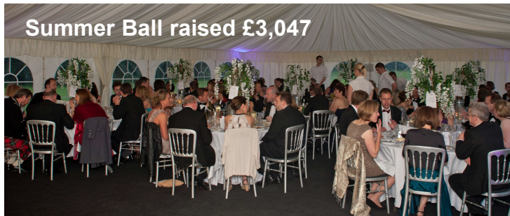
Summer Ball raised £3,047

the support received enables the parent body to make a positive contribution to the facilities available to our children. Thank you to all the families who attended our many events throughout the year and to all those parents who helped out.