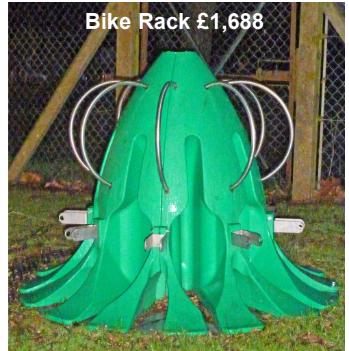
Bike Rack £1,688