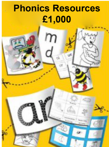
Phonics Resources £1,000