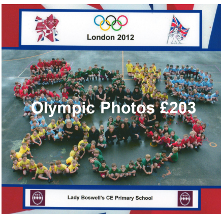
Olympic Photos £203