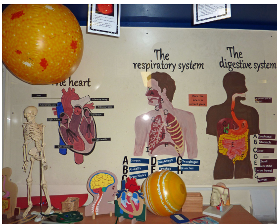
Classroom Contributions £1,400