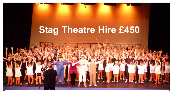
Stag Theatre Hire £450