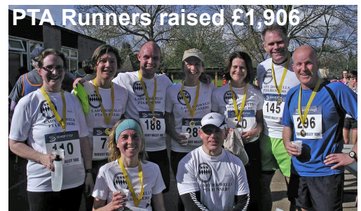
PTA Runners raised £1,906