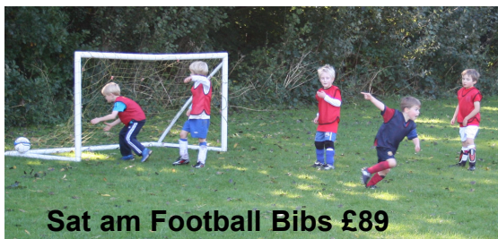
Sat am Football Bibs £89