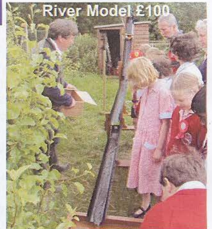
River Model £100