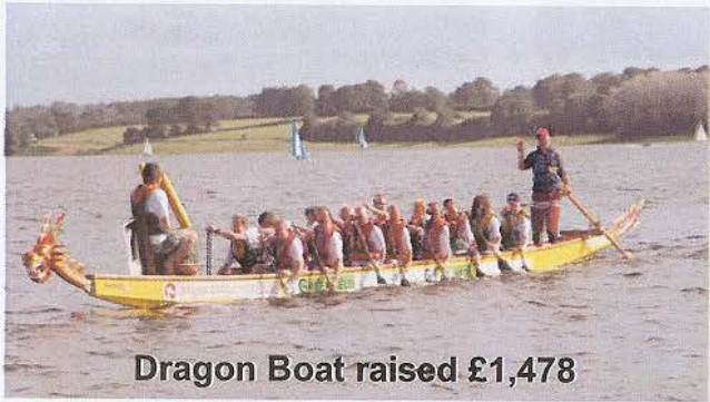
Dragon Boat raised £1,478

Your PTA works very hard at organising these events and is pleased that the support received enables the parent body to make a positive contribution to the facilities available to our children. Thank you to all the families who attended our many events throughout the year and to all those parents who helped out.