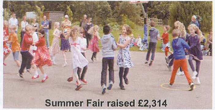
Summer Fair raised £2,314

There were many fundraising events during the year including the ever popular and always successful Christmas Bazaar £2,737, Summer Fair £2,314, Dragon Boat Race £1,478, Fireworks £1,022 and playground cake sales £1,330. The Quiz Night, Children's Discos, Mother's Day and Father's Day Shops, PTA Tennis and Runners, Fashion Show, and www.easyfundraising.org.uk raised significant further funds. There was no summer ball in 2013 as this is a bi-annual event. We are looking forward to the 'Midsummer Ball' on 20 June 2014.