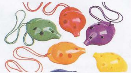
Ocarinas & Music £261