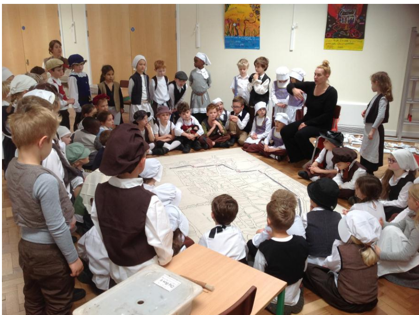
Year 2: Great Fire of London Day

Year 3: Egyptian Day Year 4: Viking Day Year 5: Greeks Day