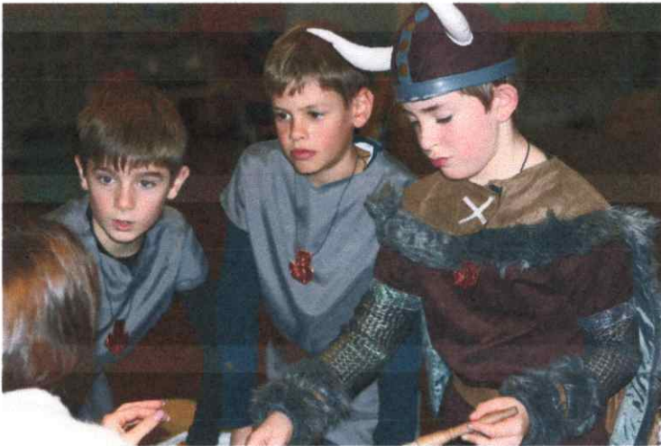
Year 4: Saxon Day

Each year group received funding for a topic-related Enrichment Day