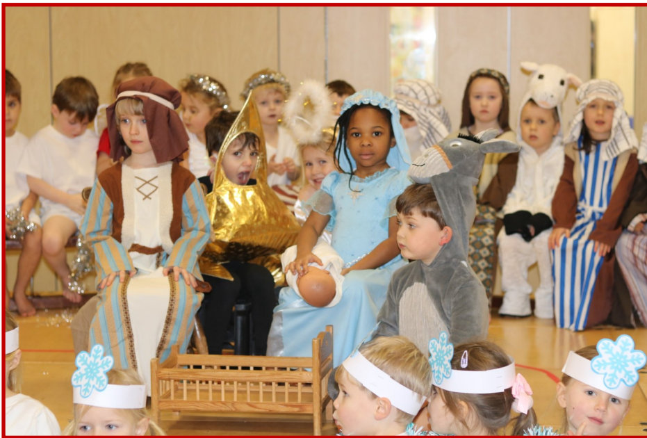
For the first time ever, Year R performed their own Nativity