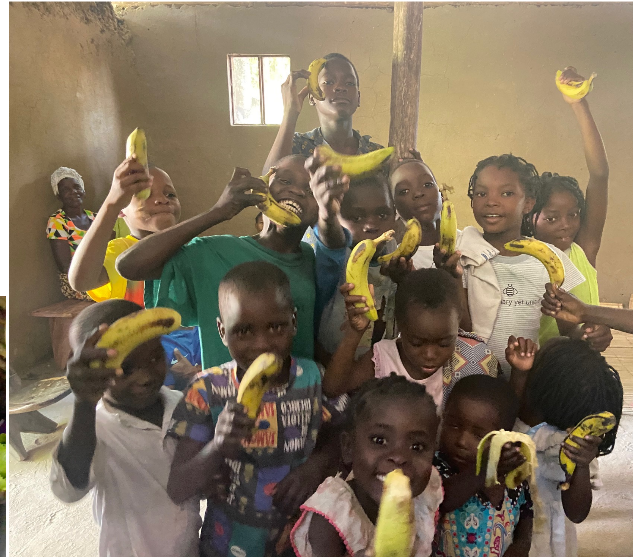
Children in Dondo receiving FOM bananas straight from the Africa Naturally farm