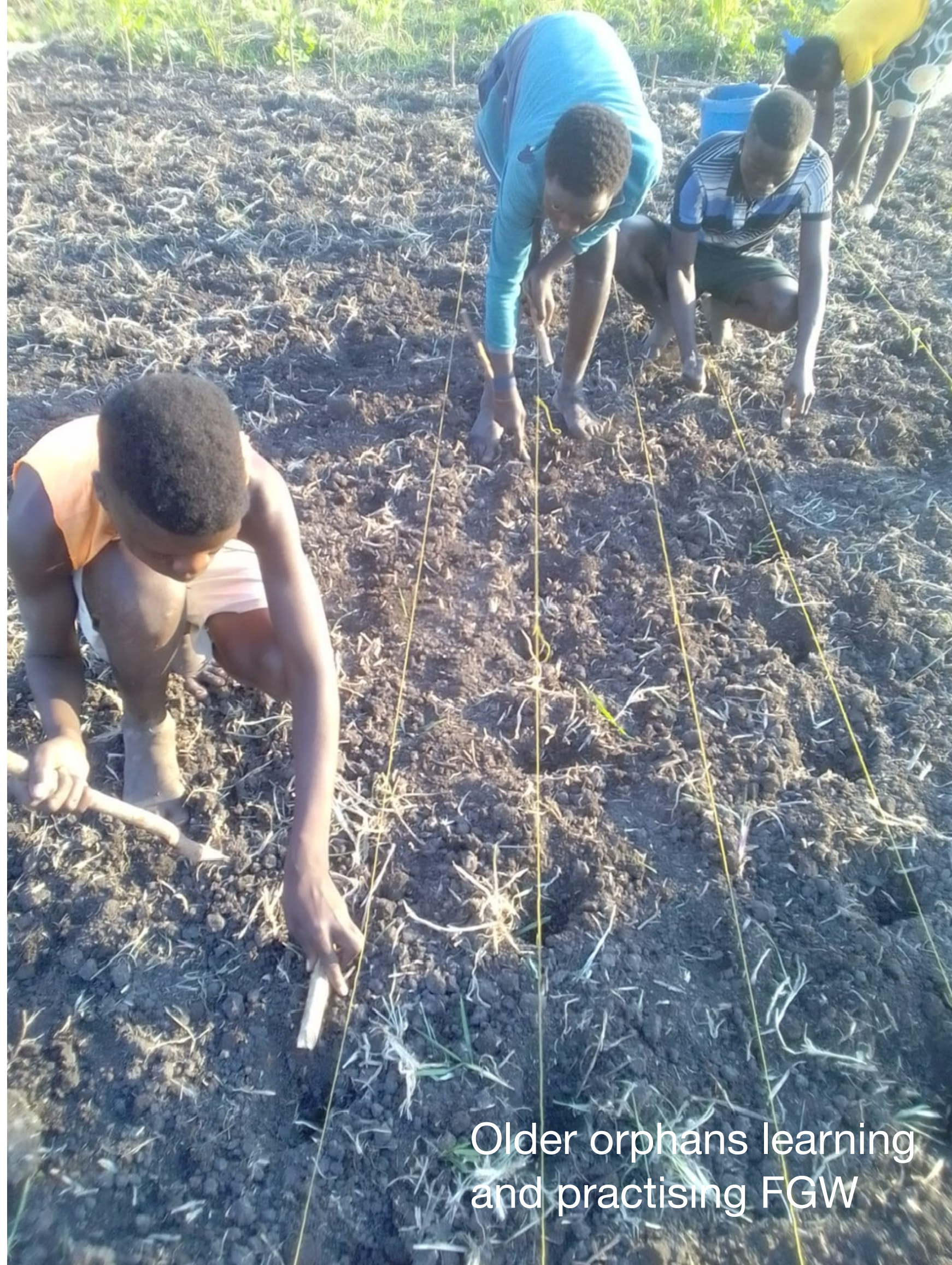
Older orphans learning and practising FGW

The church vegetable gardens are a great encouragement for others living nearby