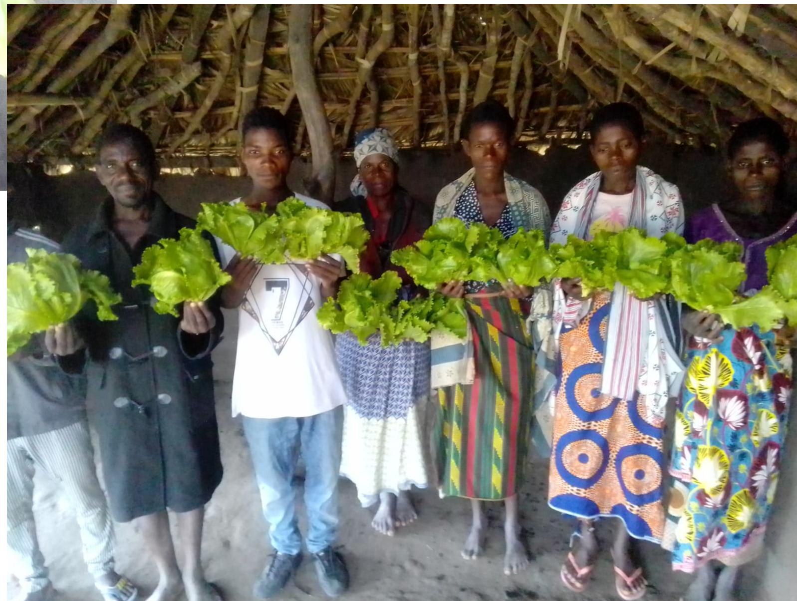
Widows receiving lettuce and cabbage in August, given by one of the churches linking with Growing Hope