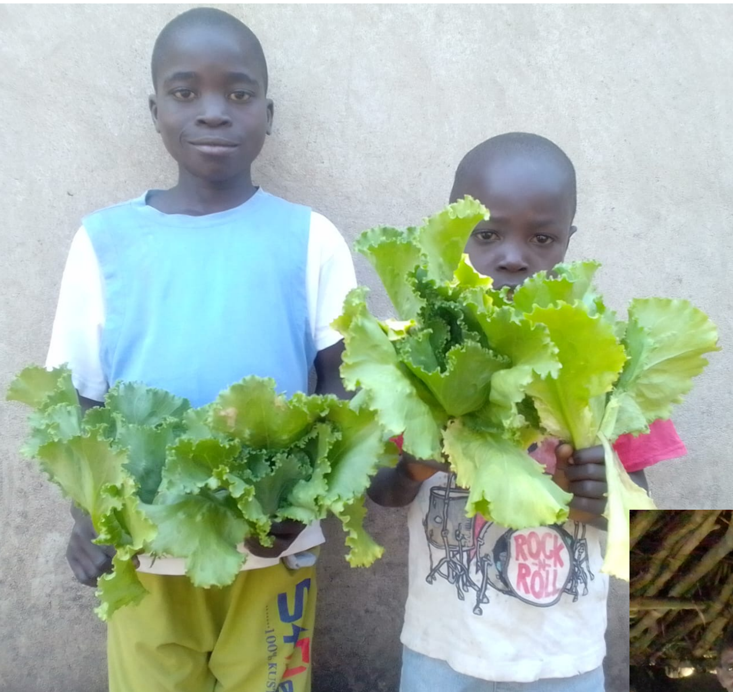
Two orphans receiving vegetables from a church in Caia. Both parents have disappeared.