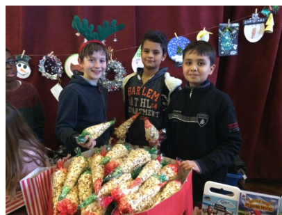
Worship Council Christmas Fayre £187 Christmas Collections £923