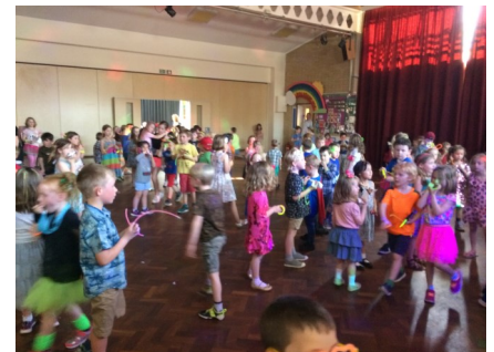
Disco FOM £850

Jesus said: 'For I was hungry and you gave me something to eat, I was thirsty and you gave me something to drink.... I tell you the truth, whatever you did for one of the least of these brothers of mine, you did for me' Mathew 25 v 35-40