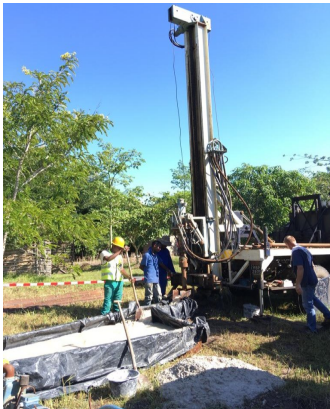
Lady B's 'Busy Bees' initiative raised £5,454

Sept 2017—July 2018—TOTAL RAISED £11,719