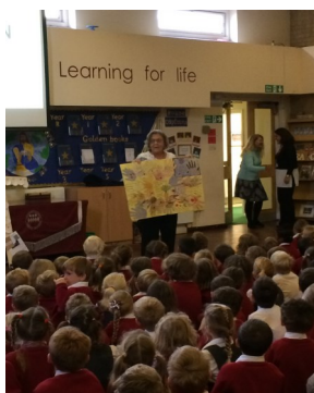
Harvest Assembly £2,305

Latest News—Boreholes Installed. Two boreholes have been installed at the Africa Naturally Farm (following fundraising efforts last year). Borehole 1 is 23m deep and borehole 2 is 27m deep. Together they give 2000 litres per hour of water. This will help the long term sustainability of FOM particularly through drought.