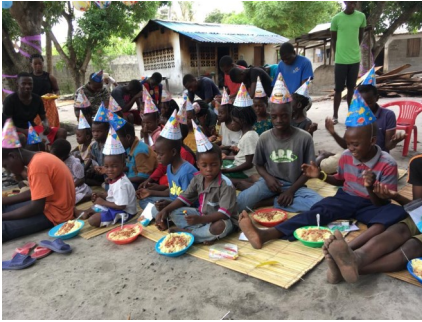
FOM Children's Party