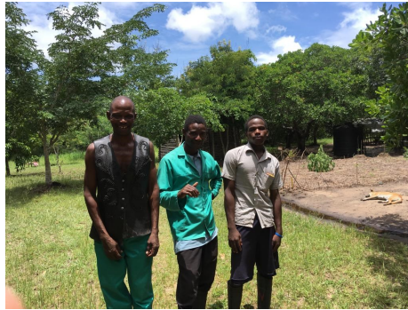
The FOM Team