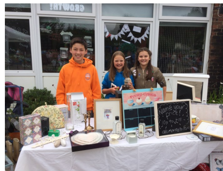
Worship Council—Summer Fayre—£192