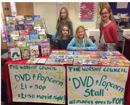
Worship Council— Christmas Fayre - £160 and Collection—£789

This years FOM Fundraiser was based on Hebrews 12 v 1 “let us run with perseverance the race marked out before us, fixing our eyes on Jesus”. The whole school community rose to the challenge of running a 5K run in the heat and KS1 experienced first hand what it is like to carry water in buckets—just like in Mozambique!