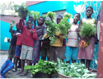
The children with the harvest