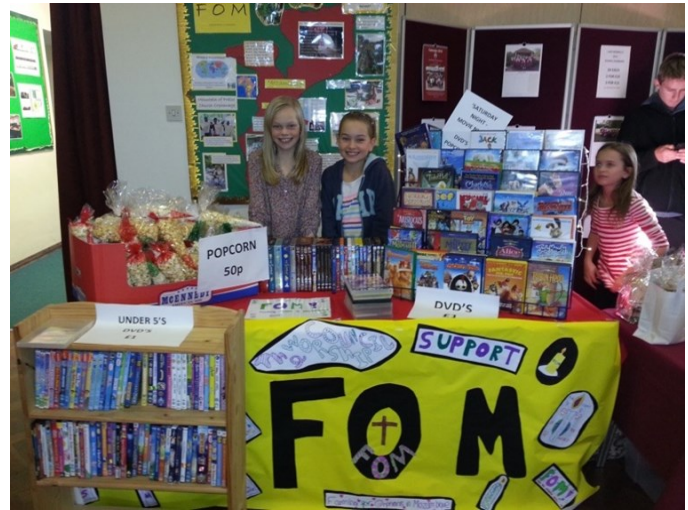
Worship Council Christmas Fair—£405