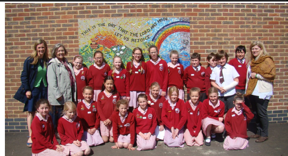
The Worship Council 2014/2015.