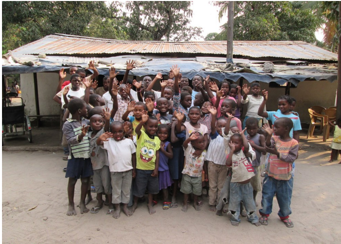
The children at the Mountain of Praise Orphanage

2009—Africa Naturally links with the Mountain of Praise Church Orphanage and provides land for rice production.