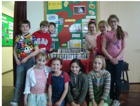
The Worship Council 2013/2014

Here is a picture of Armando on the land before it was turned into a vegetable field