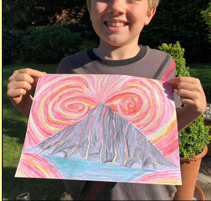
Well done to Edward L-N, Year 3, for this vibrant volcano drawing