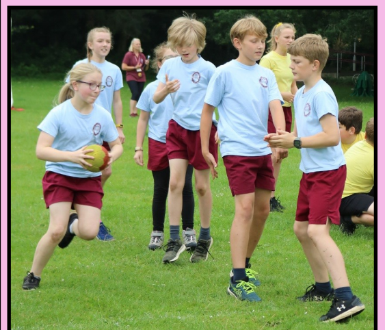
Top four pictures: Year 5 Bottom four pictures: Year 6