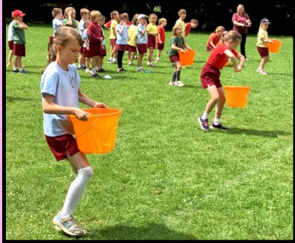
Above, left and right: Year 2 Centre: Year 3 Bottom 3 pictures: Year 4