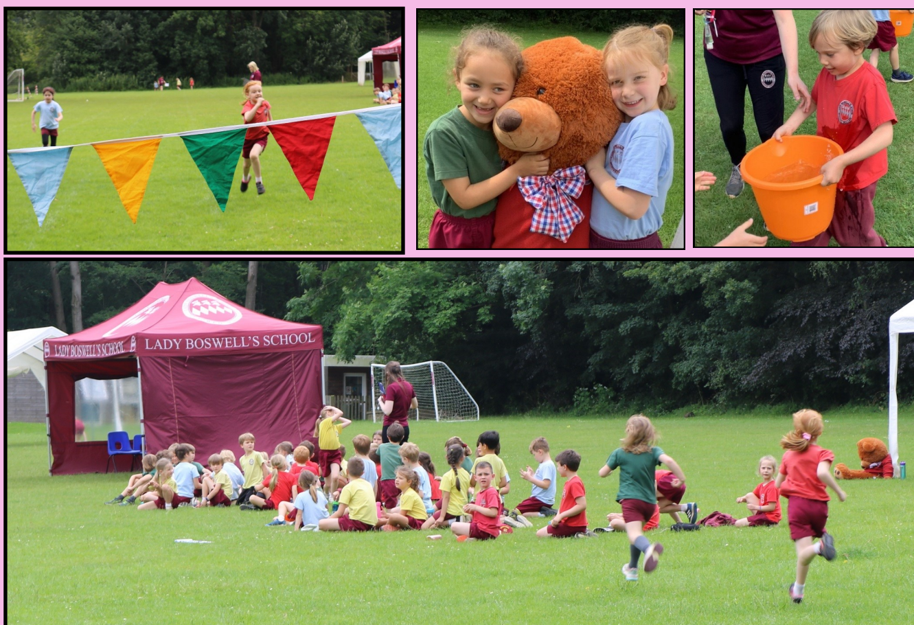
Pictures above: Year 1