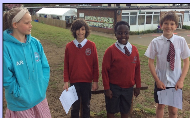
Year 6 Eco Councillors