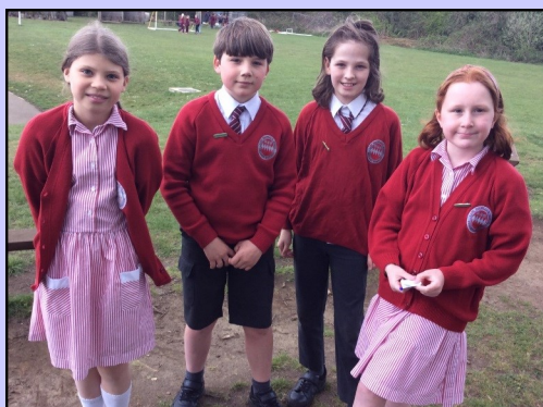
Year 5 Eco Councillors

The Eco Council has been busy ensuring that the birds are fed every week and are keen to hear ideas from the children across of the School of what further we can do to help the environment. Ideas/suggestions can be given to the Eco Council reps or placed in the 'suggestions sack' at the Eco Council display in the KS2 corridor.