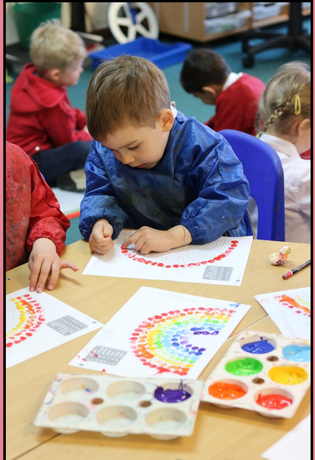
Above: Year R have been busy, out in the Year R garden, pressing flowers, and in the classroom creating some stunning finger-painting rainbows