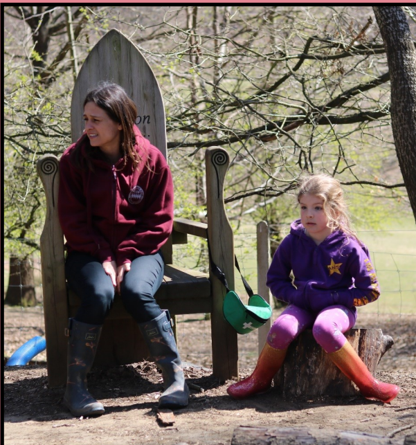
Below and right: Lilac Class enjoyed a trip to Forest School where they discussed and took part in investigations on their science topic for this term, plants.