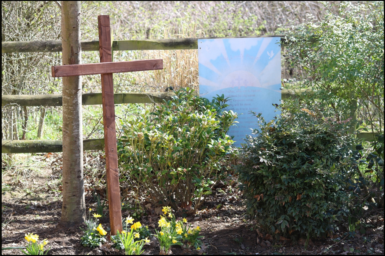
Above: Our spiritual garden in the sunshine