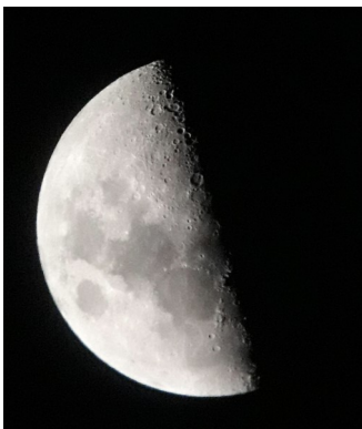
Photo taken on Monday through one of the telescopes

We'd like to say a HUGE thank you to the Orpington Astronomical Society, and their volunteers, for leading such a brilliant evening for us. Their passion for astronomy was infectious and will have undoubtedly inspired a number of our pupils! Thank you to those of you who attended - we hope that you all had an enjoyable evening!