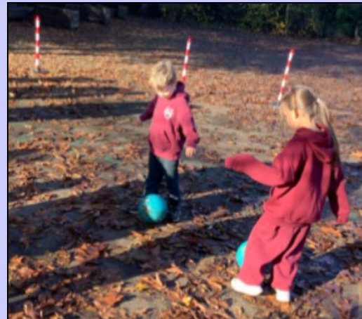
Willow Class practised controlling the ball with their feet

What a glorious day for 'Outdoor Classroom Day'. All of our year groups managed to get outside to enjoy a huge range of activities with many classes taking a trip to Forest School.