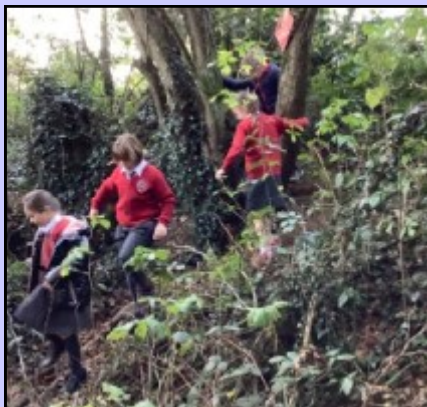
Copper Beech children looked at soil types

Oak Class travelled back in time to imagine what life might have been like in the WW1 trenches as part of their Remembrance topic.