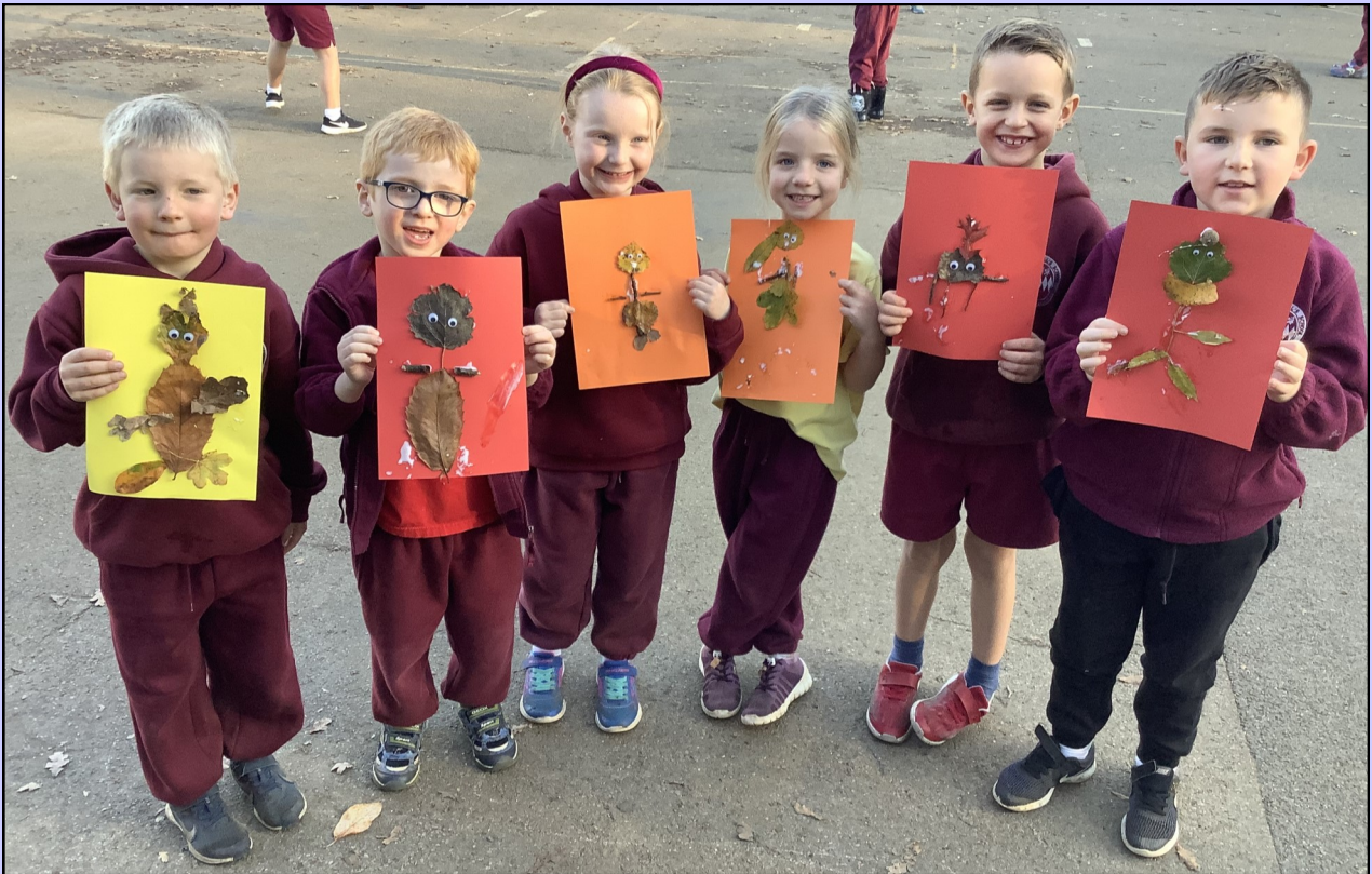
Mulberry Class enjoyed making leaf people with 'googly' eyes!