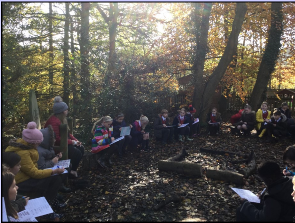
Elm Class were also studying trenches as part of their WW1 and Remembrance topic