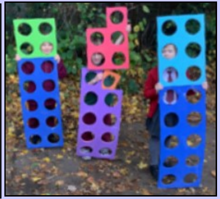
Willow Class sequenced numbers