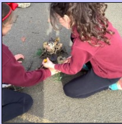
Silver Birch making 3D shapes with sticks