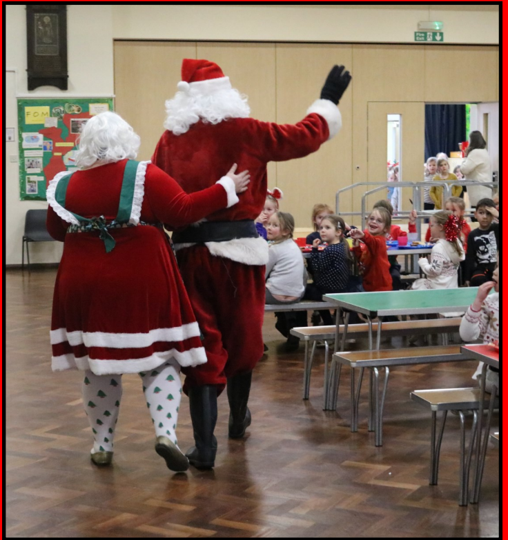
THE CHILDREN WERE THRILLED TO SEE SANTA WALKING THROUGH THE HALL AND IN HIS GROTTTO