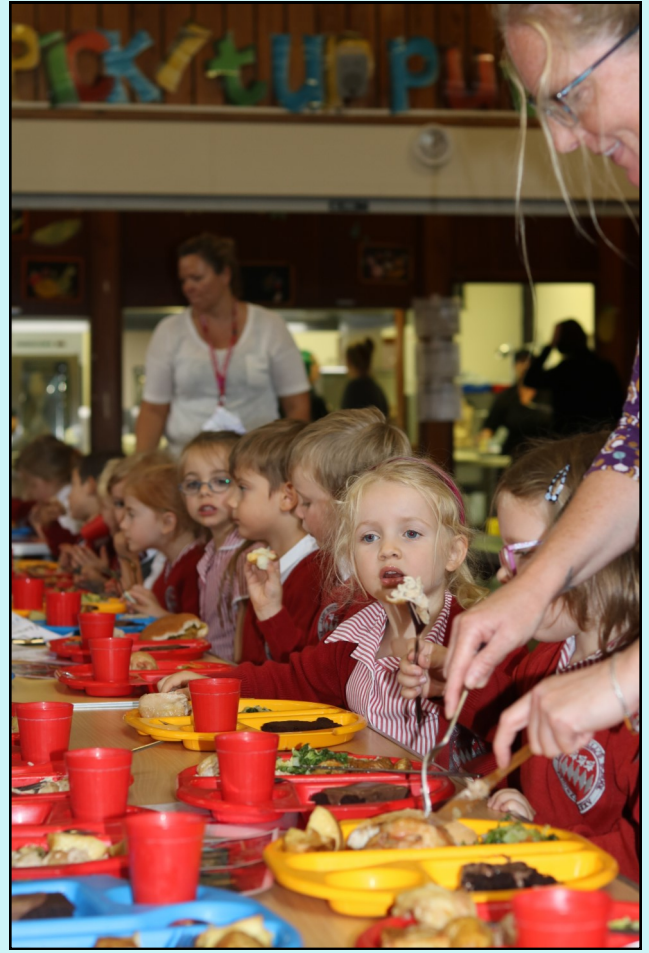
YEAR R ENJOYING LUNCHTIME AT SCHOOL