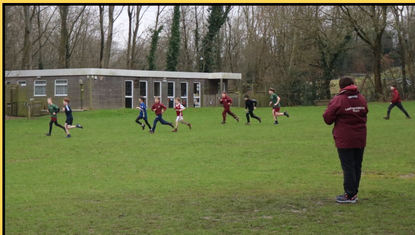
Clockwise from above: Cross Country Club, Senior Dance Club, Orchestra, Football Club and Knitting Club