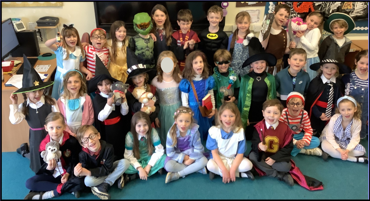
Above: Mulberry Class on World Book Day