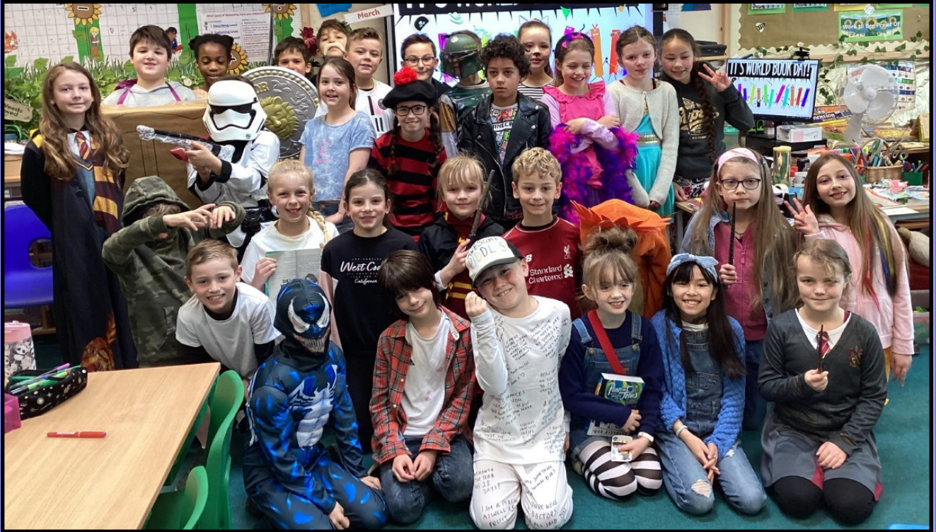
Above: Sycamore Class